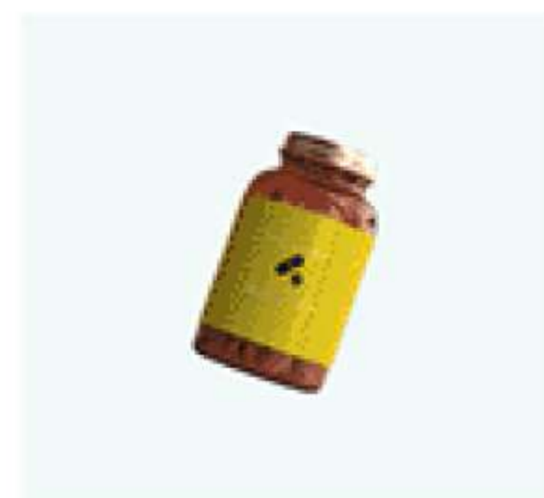
Alicet 5mg Tablet