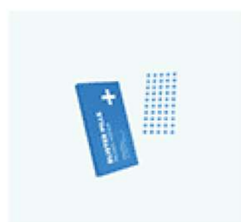
Napa 20mg Tablet