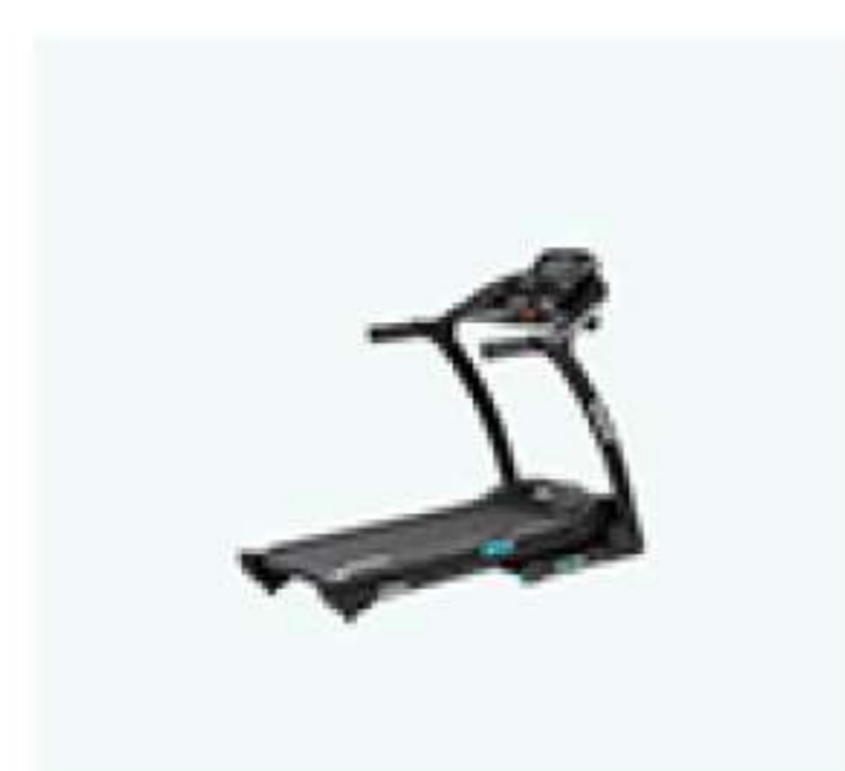
Gold S390 Treadmill