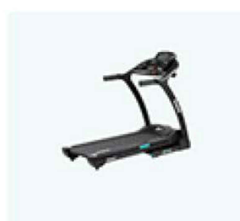
Gold S390 Treadmill